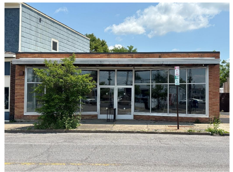
Front of Building. Mural Dimensions: 3' x 3' for each section.