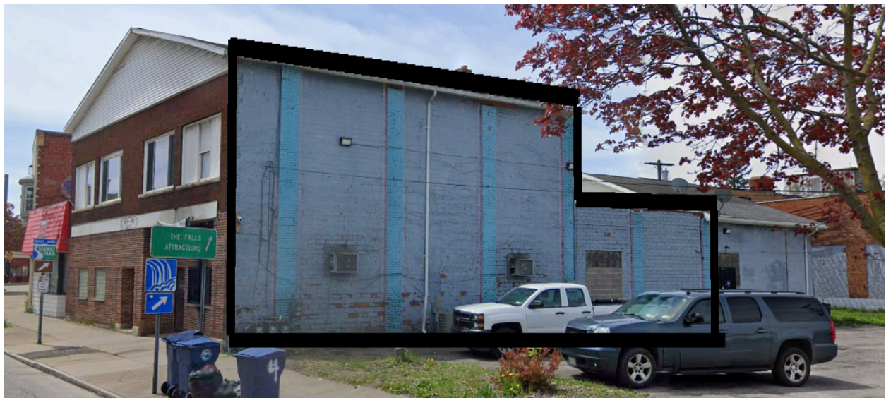
Mural Dimensions: 30' high x 39' wide, 16' high x 23' wide

There are two distinct sections of the wall that are to be painted with one cohesive design. The first section of the wall is 30' high x 39' wide, and the second section is 16' high x 23' wide. The combined width of the wall is 62'.