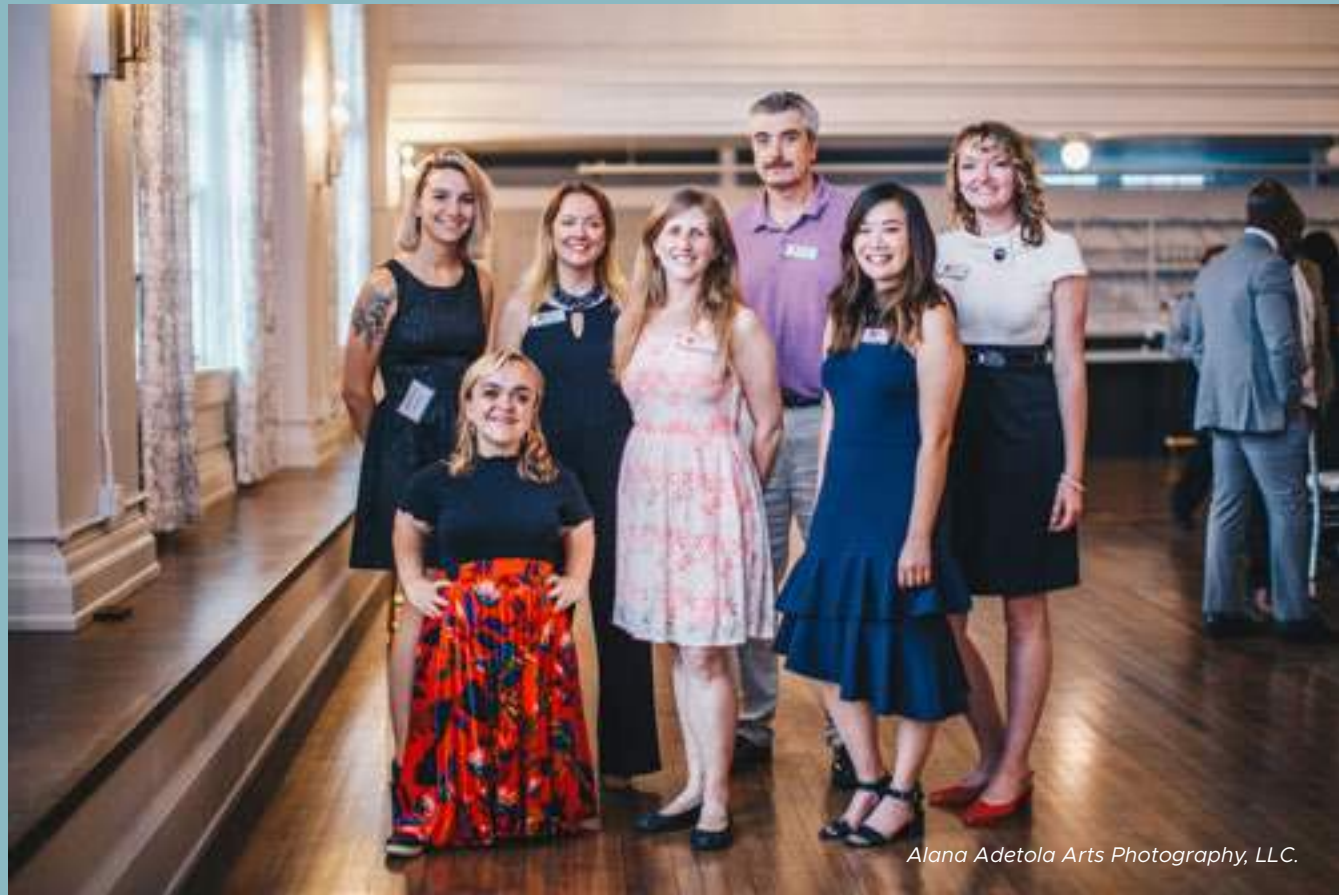
Alana Adetola Arts Photography, LLC.