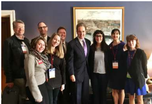
ASI staff & NYS advocates meet Congressmen Brian Higgins in Washington DC during Arts Advocacy Day