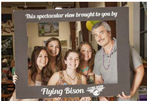
ASI staff gather at Flying Bison during NOLA Fest fundraiser