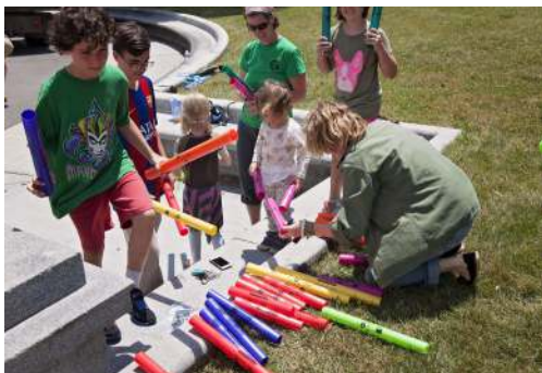
Kids participate in Make Music Day 2017 with a group 'Boomwackers Play Along' at Albright Knox Art Gallery