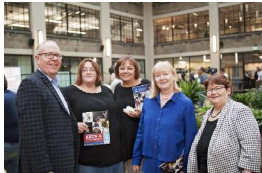
Niagara County cultural leaders attend ASI's Arts and Economic Prosperity 5 Report release at 500 Seneca St.