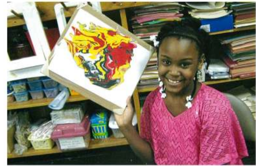
Francis Center's after school Program received ASI DEC Grant funding for their Fine Art Fridays