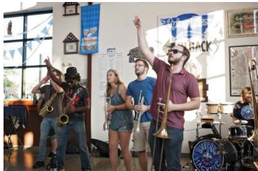
The Buffalo Brass Machine performs at ASI's NOLA Fest Fundraiser while raising funds for Hurricane relief in New Orleans