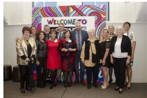
Awardees gather at the 4th Annual Spark Awards at Hotel Henry