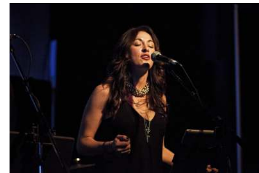
2017 Lawyers for the Arts event raises funds for the Give for Greatness program administered by ASI