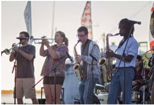
Buffalo Brass Machine plays at Cultural Connections at Canalside