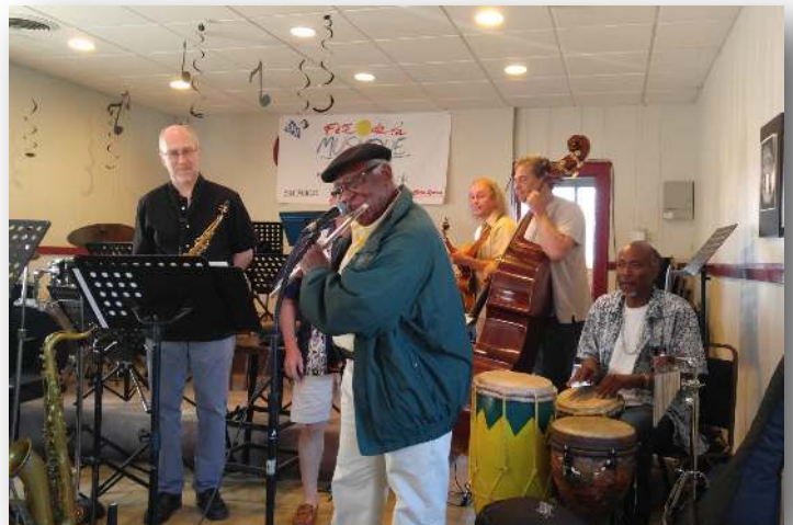
Performance at Colored Musicians Club during the first Make Music Day WNY

Make Music Day follows the belief that the arts are for everyone by hosting a free day long festival where everyone can participate, no matter their skill level, age or location. Make Music Day allows ASI to strengthen existing partnerships in the WNY community and pushes ASI to create new partnerships with music based organizations and individual musicians. This program had an audience of approximately 5,000 people in 2016.