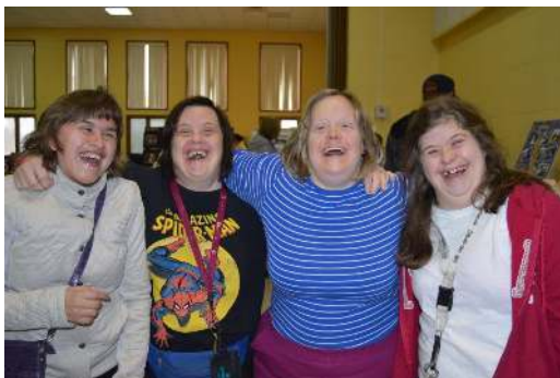
A group from Opportunities Unlimited, a 2016 DEC grantee