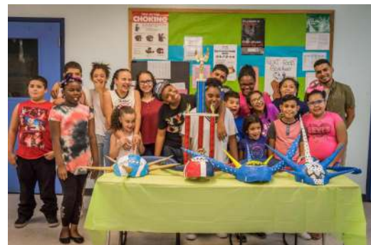
A group from the Belle Center show off their work, a 2016 DEC grantee