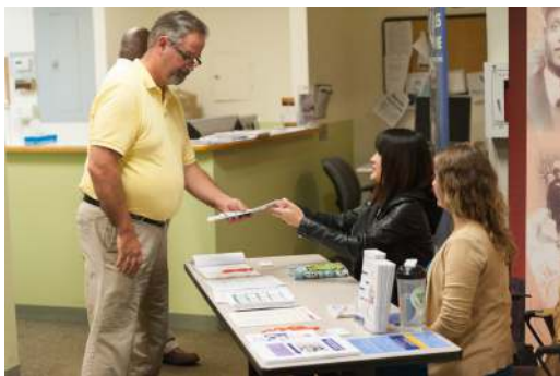
Attendees sign in at the Accessible Events Training, a part of the ASI Professional Development Series