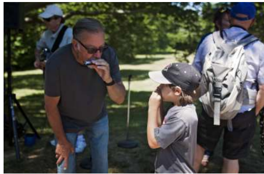
The public participates in Make Music Day's Harmonica Play Along at Niagara Falls State Park