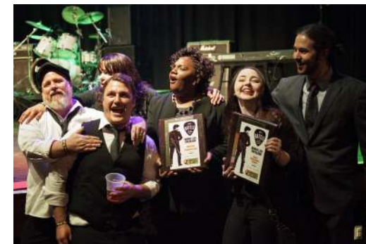
Winners from a variety of categories gather at the Battle of the Corporate Bands, a fundraiser for Give for Greatness and Music Is Art