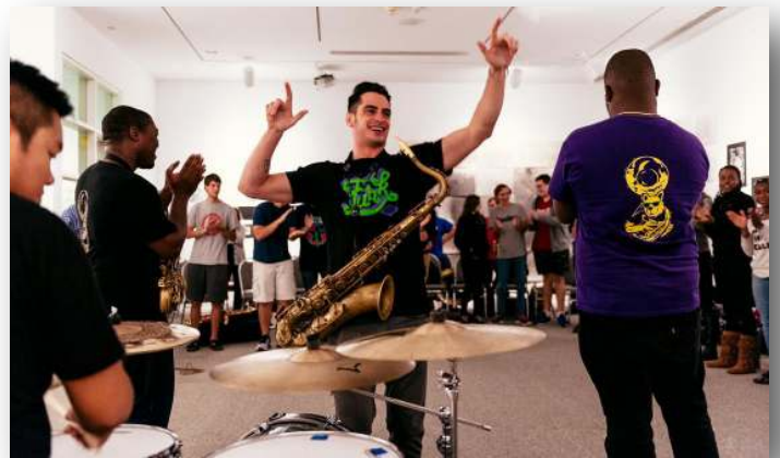
Funky Dawgz mentor students at UB Center for the Arts

The Big Easy in Buffalo celebrates 10 years! The Big Easy in Buffalo, a program of ASI, brings the best New Orleans and Louisiana bands to Buffalo for live performances and celebrates all things NOLA . Local professional and student musicians receive mentoring and education from these world touring musicians.