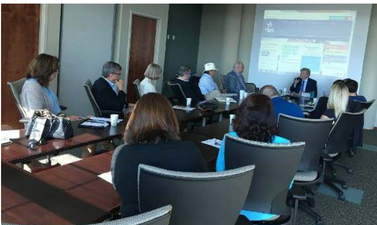
Local business leaders discuss the impact of the arts on our community's economy