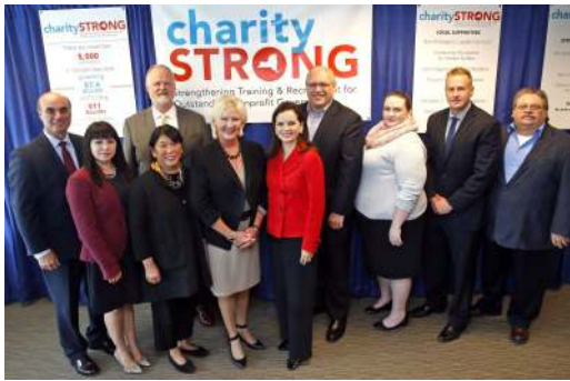
ASI serves on the charitySTRONG's WNY advisory board