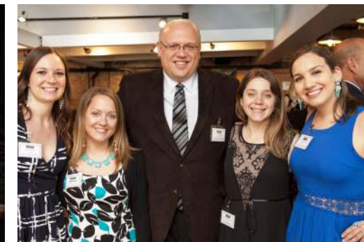
ASI staff at the 3rd Annual Spark Awards