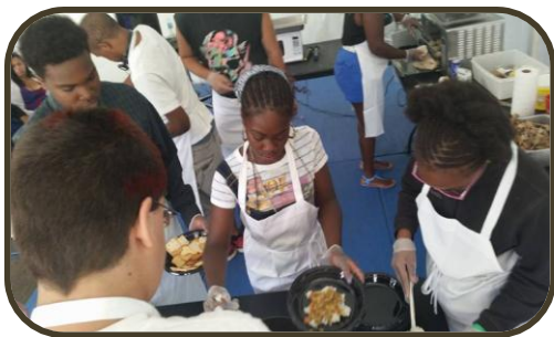
F-Bites Culinary Class