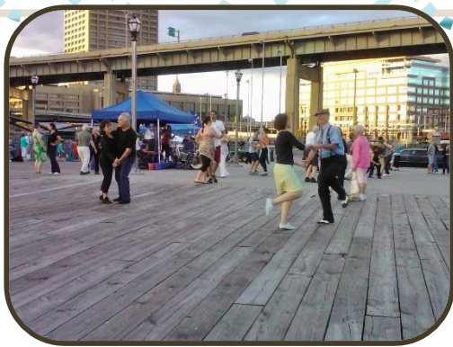
Canalside Music and Dance Series