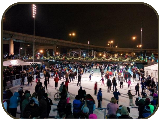
Canalside Ice Rinks Grand Opening 2014