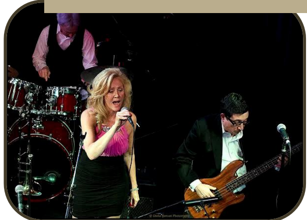
One of G4G's fundraisers, the Lawyers for the Arts Event 2015